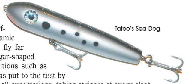
Tatroo's Sea Dog

The new "Sea Dog" from Tatroo's Tackle is sure to become a surfcaster's secret weapon. Because of its hefty size and aerodynamic shape, this 6-inch, 3-ounce topwater plug has the ability to fly far beyond the breakers in even stiff onshore winds. And, its buoyant cigar-shaped body enables it to be effectively worked in more challenging conditions such as strong currents and a relentless chop. Before its release, this plug was put to the test by some of the East Coast's most seasoned surfcasters, and it exceeded all expectations, taking stripers of every class and holding up to countless bluefish attacks. Like all Tatroo's surf plugs, this lure is hand-turned from select hard wood, thru-wired, and rigged with superior components such as extra heavy belly swivels, Wolverine split rings and needle-sharp VMC hooks. The custom multi-coat finishes are also very impressive, anglers can choose from traditional, baitfish or classic series paint schemes. Look for more models from this very talented lure maker coming soon. For more information visit www.tatoostackle.com .